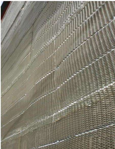
Fastened at the furr

In Structalath and Twin Trac there are 28 furrs in every sq ft and in Mega Lath there are 48 furrs in every sq ft. Structa products can be attached to the framing member anywhere on the lath – at the furring points, along the horizontal wires, at intersection of wires or between or across the twin tracs.