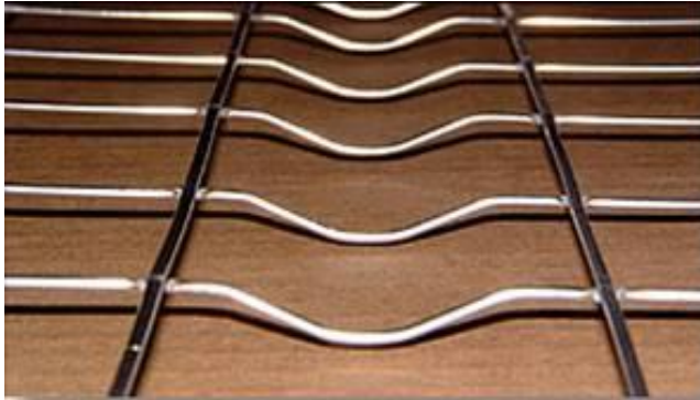
Hat Channel Furr

The furring of Structa products is created by a hat channel that are 3/8" deep.