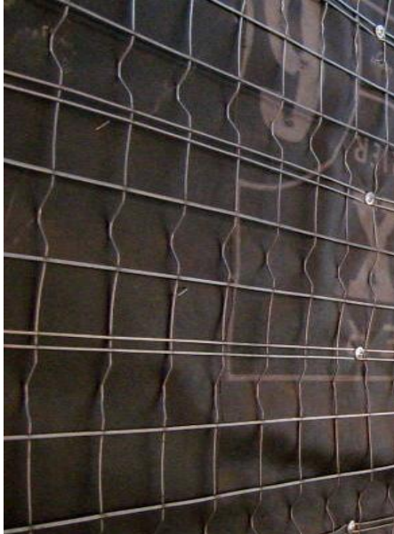
Fastened at twin trac

In Structalath and Twin Trac there are 28 furrs in every sq ft and in Mega Lath there are 48 furrs in every sq ft. Structa products can be attached to the framing member anywhere on the lath – at the furring points, along the horizontal wires, at intersection of wires or between or across the twin tracs.